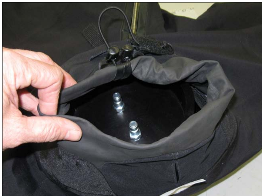
Figure 3. Step c. Suit Leakage Test