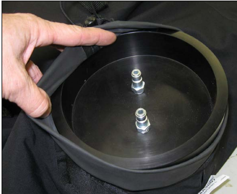
Figure 4. Step d. Suit Leakage Test