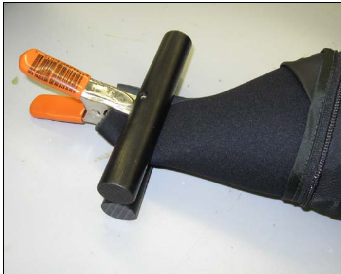
Figure 7. Step g. Suit Leakage Test