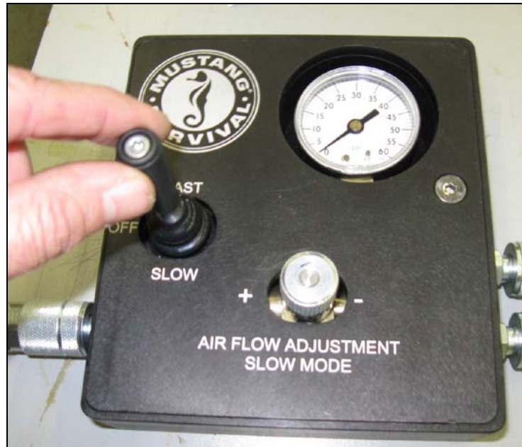
Figure 12. Step I. Suit Leakage Test