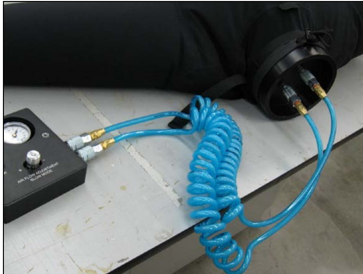
Figure 10. Step j. Suit Leakage Test