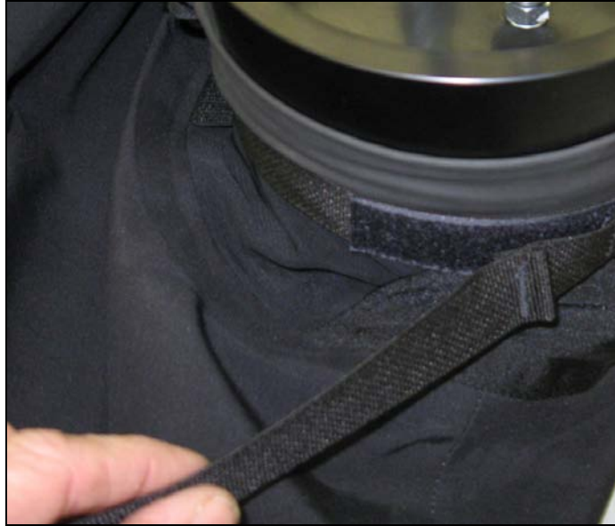
Figure 6. Step f. Suit Leakage Test