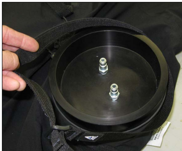
Figure 5. Step e. Suit Leakage Test