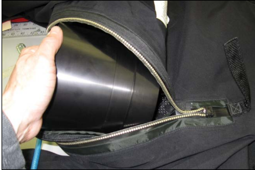
Figure 2. Step b. Suit Leakage Test