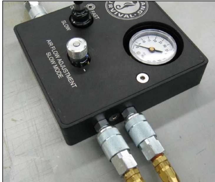
Figure 8. Step h. Suit Leakage Test