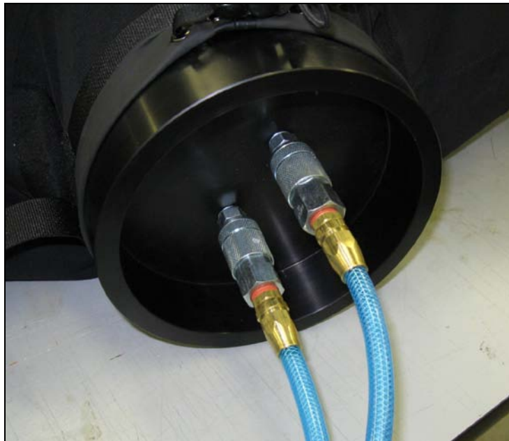
Figure 9. Step i. Suit Leakage Test