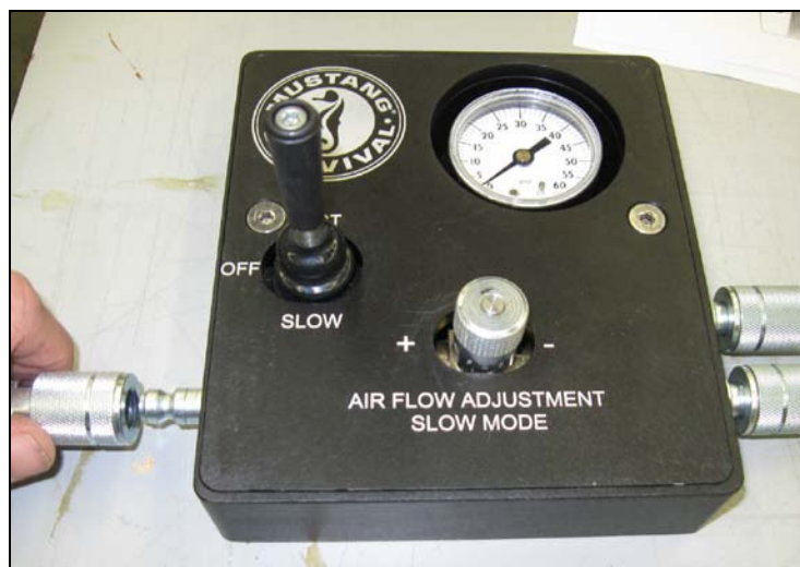
Figure 11. Step k. Suit Leakage Test

NOTE: Ensure the control lever is set in the off position before the high-pressure air is connected.