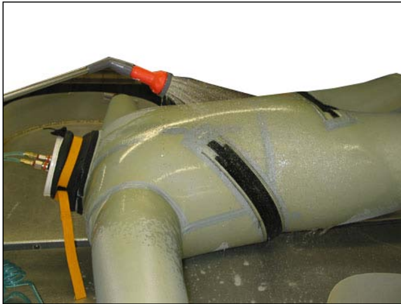
Figure 13. Step n. Suit Leakage Test